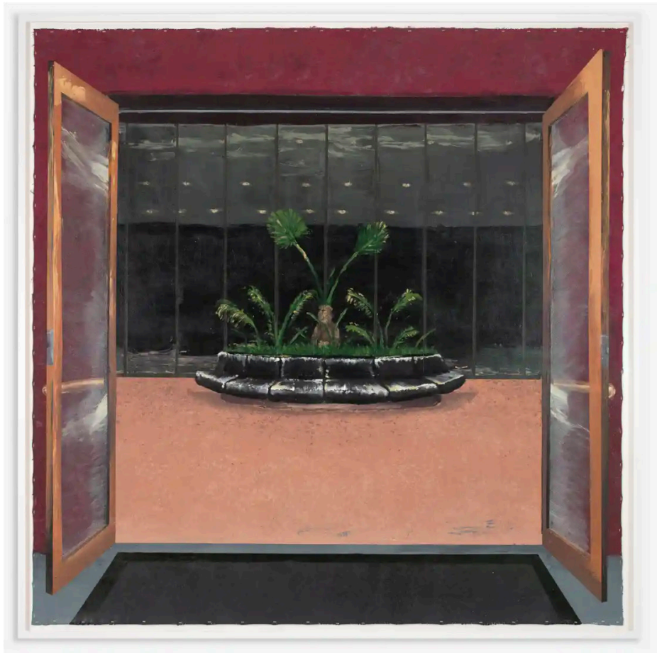
📷 Sala de Espera by Manuel Solano, 2021, acrylic on canvas.

of music, readings and films linked to Solano’s work. One surprise inclusion is Jurassic Park. A dino nerd as a kid, Solano now sees the positioning of dinosaurs in pop culture as symptomatic of the weird way preconceptions around gender identity manifest (indeed, this will be the subject of a new body of work to be shown at London’s Carlos/Ishikawa gallery later this year).