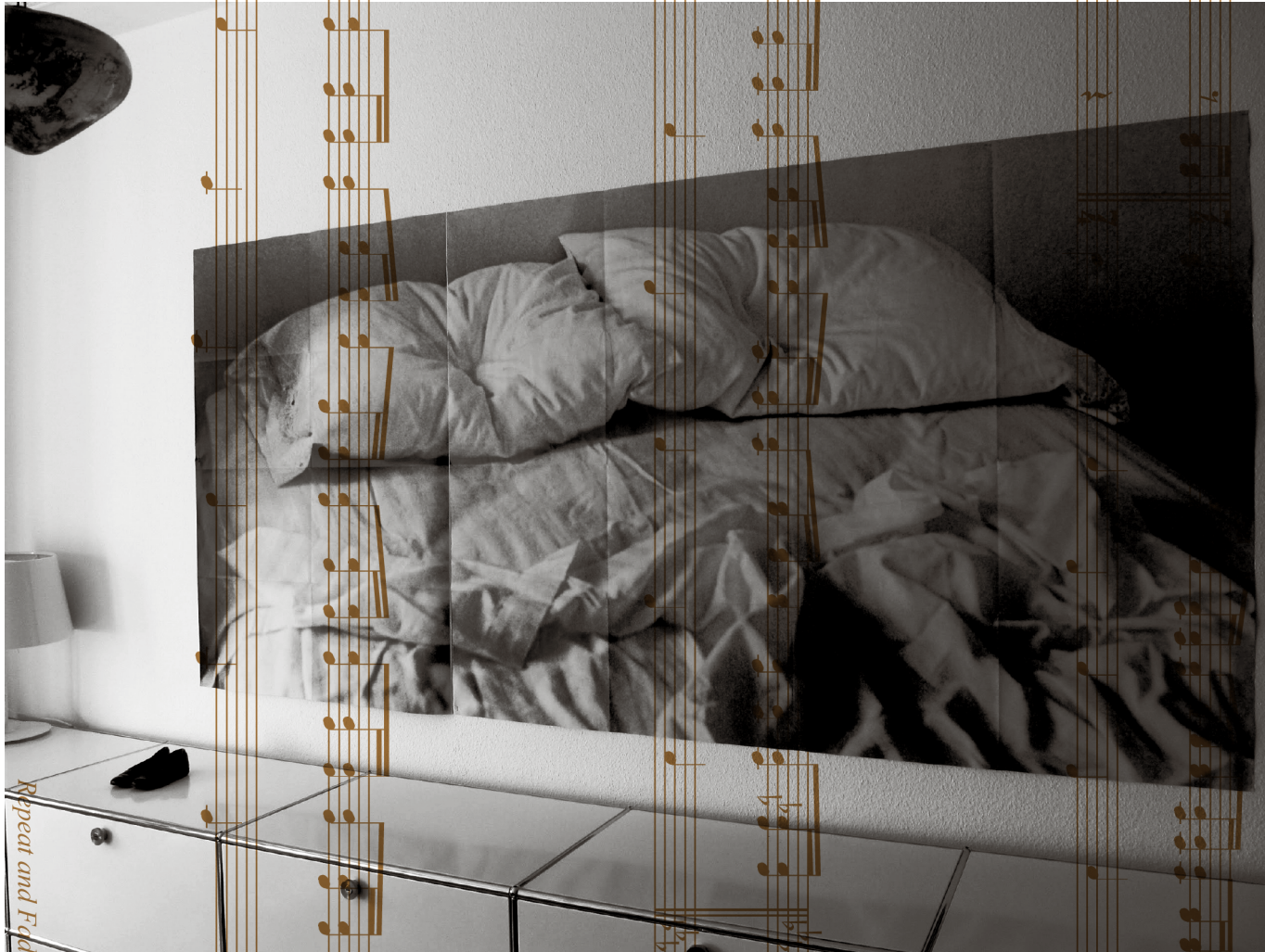
Félix González-Torres, Untitled (1991), billboard, dimensions vary with installation

price she said that I could have one for free but that they are always grateful for sweets. So that's how it came home with me and now it decorates the wall in our bedroom. I am planning to mount it on a canvas panel. This is an example that unmade beds can be quite artful.