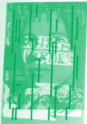
FIG. 08 VITTORIO BODMANN, BRUFOT 14, BURRIS 2012.