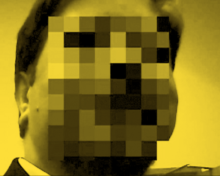
IRON MAN First UK Diamond

You really need to kill yourself to get that dream done. I almost did. And within 24 hours I'd almost killed myself to become Diamond. That's why they call me Iron Man. You know I tell everyone 3.3 million people around the world know me as Iron Man. How amazing is that! There's a fake guy who flies around calling himself Iron Man. I'm the Iron Man!