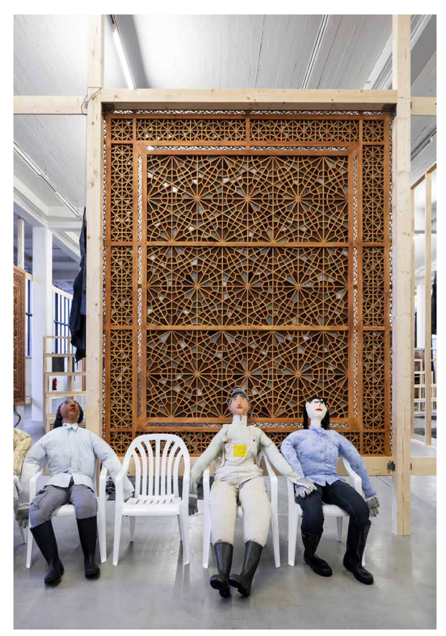
Horizontal Darkness in Search of Solidarity, 2019. Installation view at Kunstverein Hamburg, 2019.

Who better to interrogate the inherited habits of modernism, in so far as they continue to shape painting, than Oscar Murillo (b. 1986, La Paila, Colombia), an artist whose meteoric success has engendered a selfconscious scrutiny of his own creative processes and methods of display? Murillo's currency as an artist has a great deal to do with how he productively metabolized outsized expectations into a rigorous examination of painting's horizons, looking both backward and forward, inward and outward.