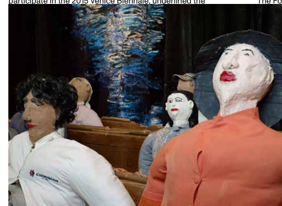
Turner Prize 2019. Installation view at Turner Contemporary, Margate. Courtesy of the artist and Turner Contemporary, Margate