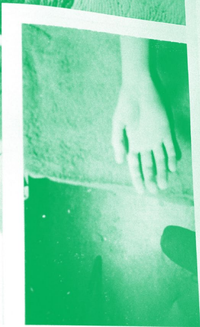
На обложке: Эрик Макклелланд / www.ericmcclelland.com Микки Пьеро, Кристиан Виттори / www.ericmcclelland.com